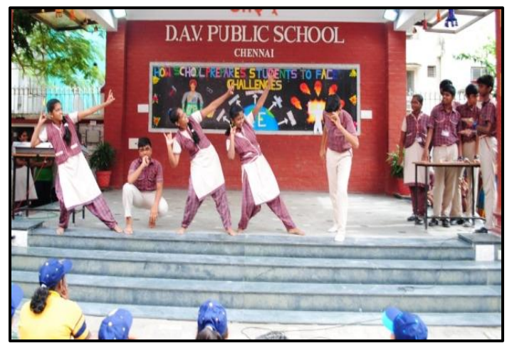
Sequence Portraying 'Facing Challenges in Life'