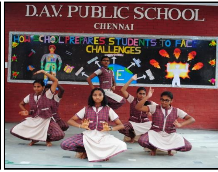
Dance Depicting the Importance of 'Time Management'