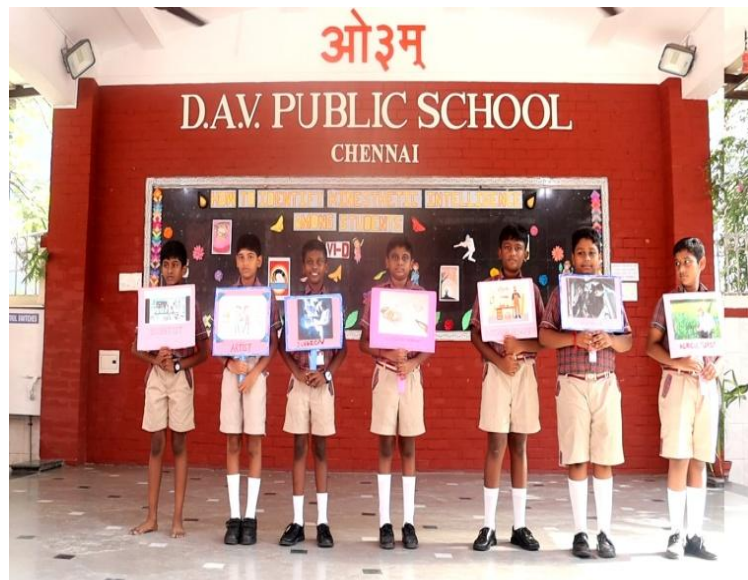
Career Affiche – Kinesthetic Skills