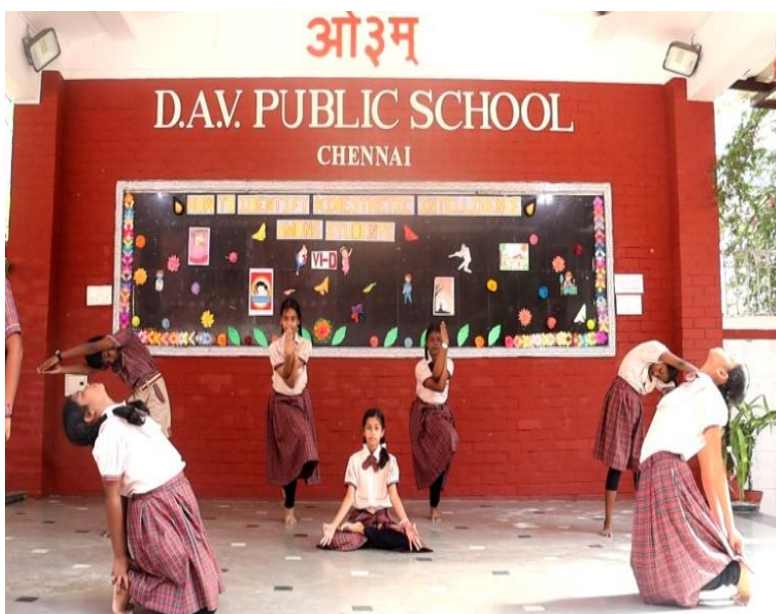
Hatha Yoga Formations