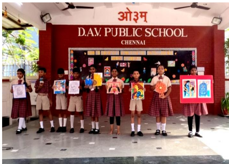
Portraiture – Art and Craft