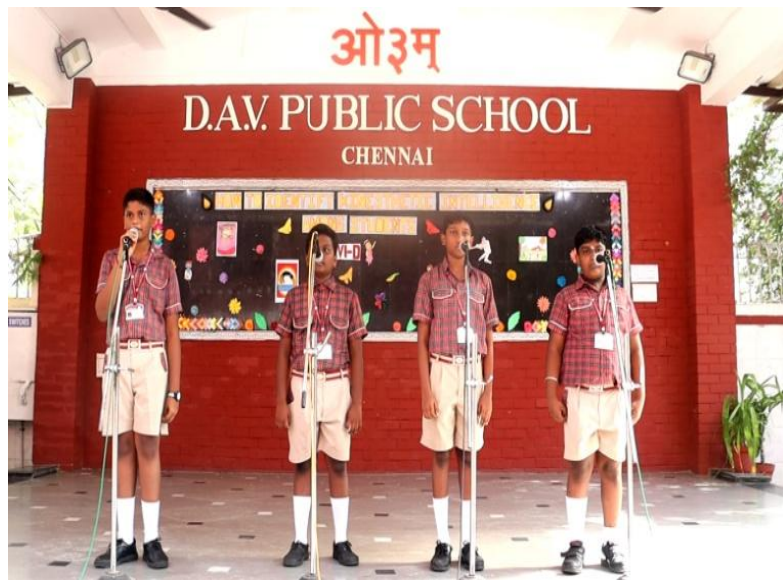
Introduction – Kinesthetic Intelligence