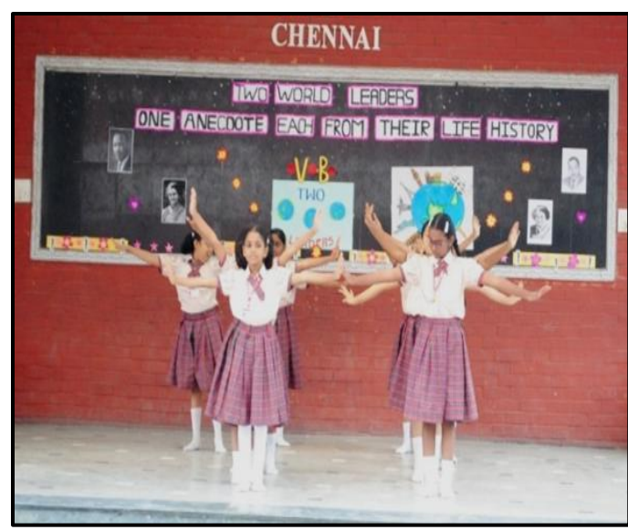
Leadership- A Musical Treat