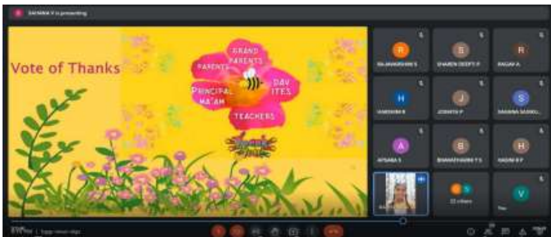
Vote of Thanks – An Animated Video