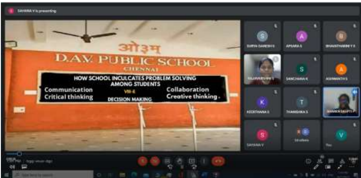
Topic and the Five Ways through which Problem Solving is inculcated in Students