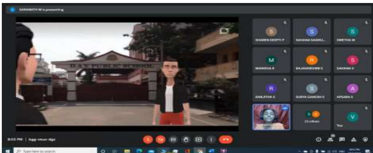
Rewind your Memories – a Graphic Feast