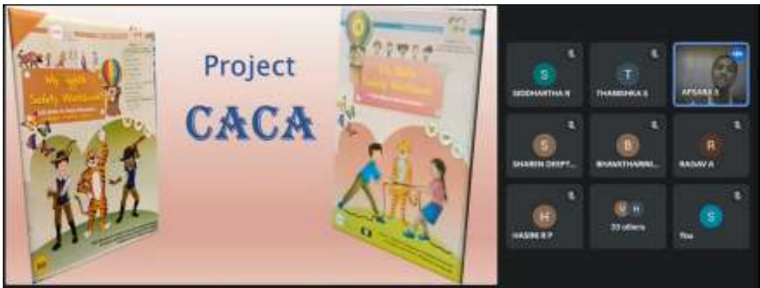
School's Initiatives – Project CACA