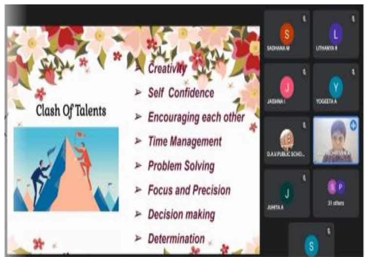
CLASH OF TALENTS - SKILLS LEARNT THROUGH COMPETITIONS