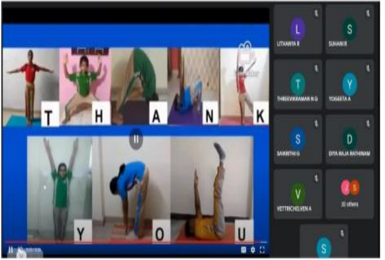
VOTE OF THANKS – YOGA POSTURES