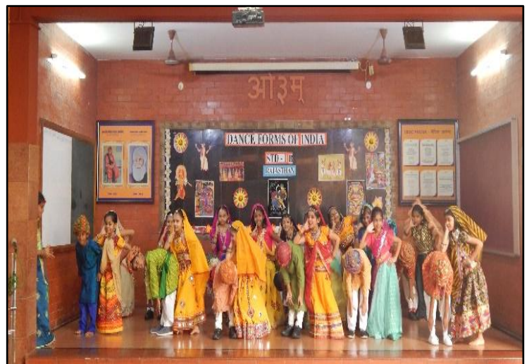
Rangilo - Puppet Dance