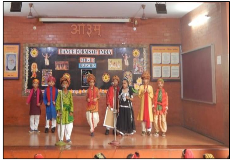
A joyful welcome dance