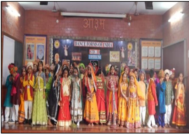
A Devotional Chant