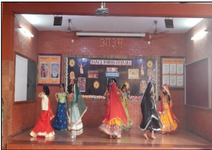
Kalbelia Dancing Dolls