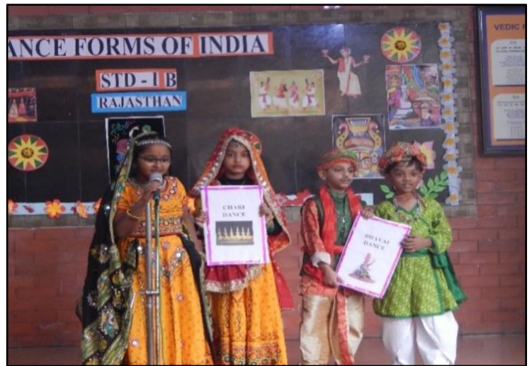
Put the word out