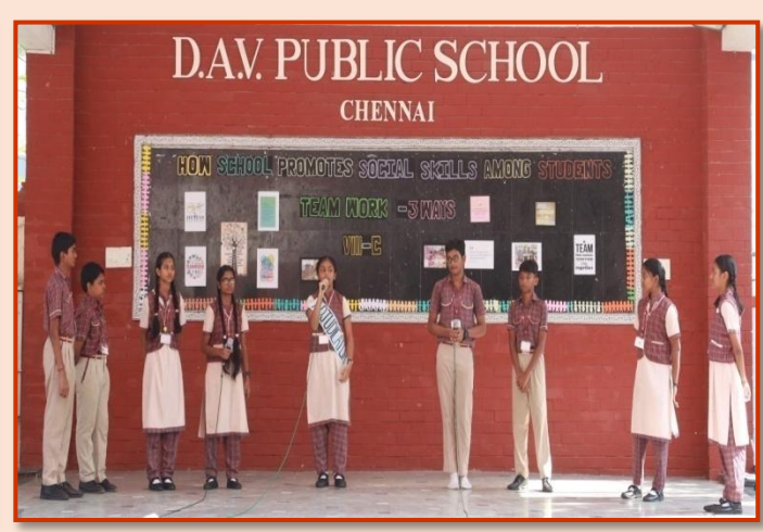
Verbal Sparring Showdown – The Debate