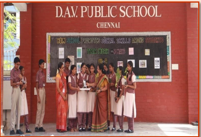
Donating the Saplings to the School