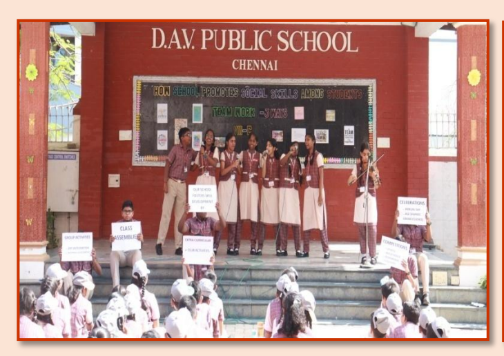
Tunes on Teamwork - Song