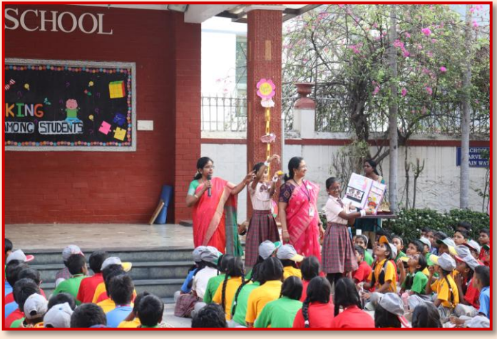
Honoured by the Principal's Presence and Appreciation