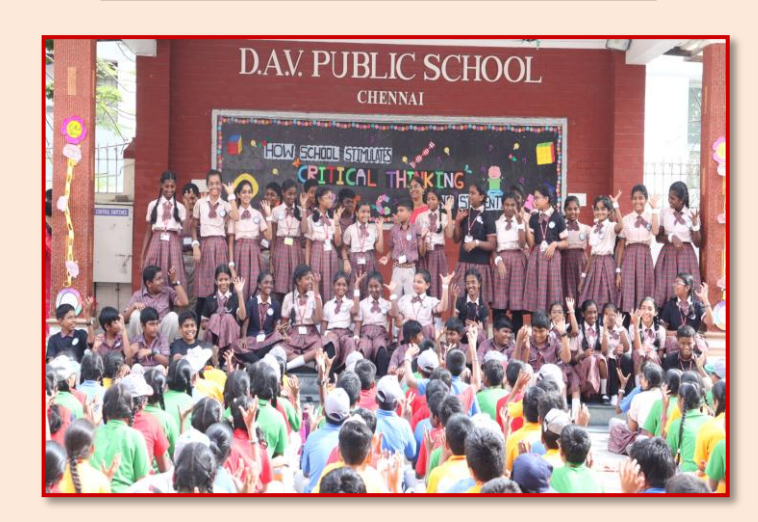
Making the Entire Audience Groove