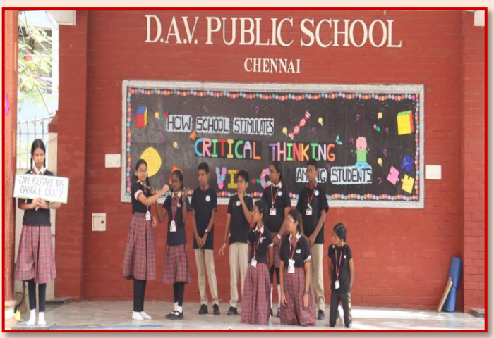
Skilled Pantomimist's Sparking Critical Thinking