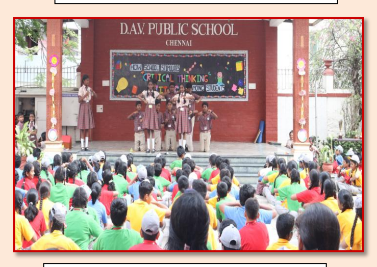
Engaging Minds Through Dramatic Vignettes